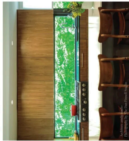
Architect: andy studio

Partnerships are essential for growth. Using Buildertrend construction technology, RJA maintains close contact with homeowners, providing daily progress reports and schedule adjustments to accelerate construction without compromising quality. Milestone surveys gather feedback for timely changes, ensuring trust and ensuring projects meet high standards and client satisfaction.