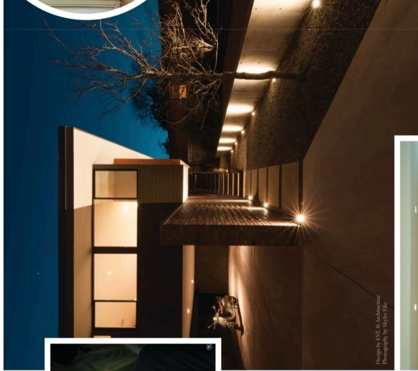
Design by EST.H Architecture

The RJA team is thrilled to announce the upcoming presentation of its custom spec home concept, scheduled for early 2025. “This initiative is the fruit of our dynamic collaboration with one of our trusted architectural partners. Together, we are finalizing plans for a unique, high-performing and healthy custom spec home, designed to set new standards